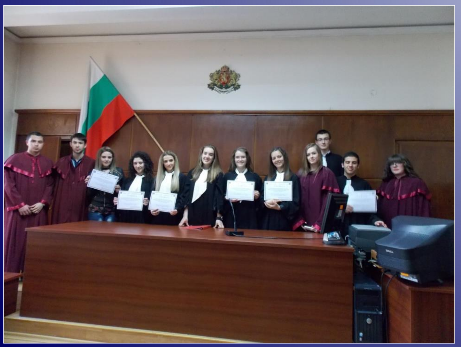
Thank you for your attention!